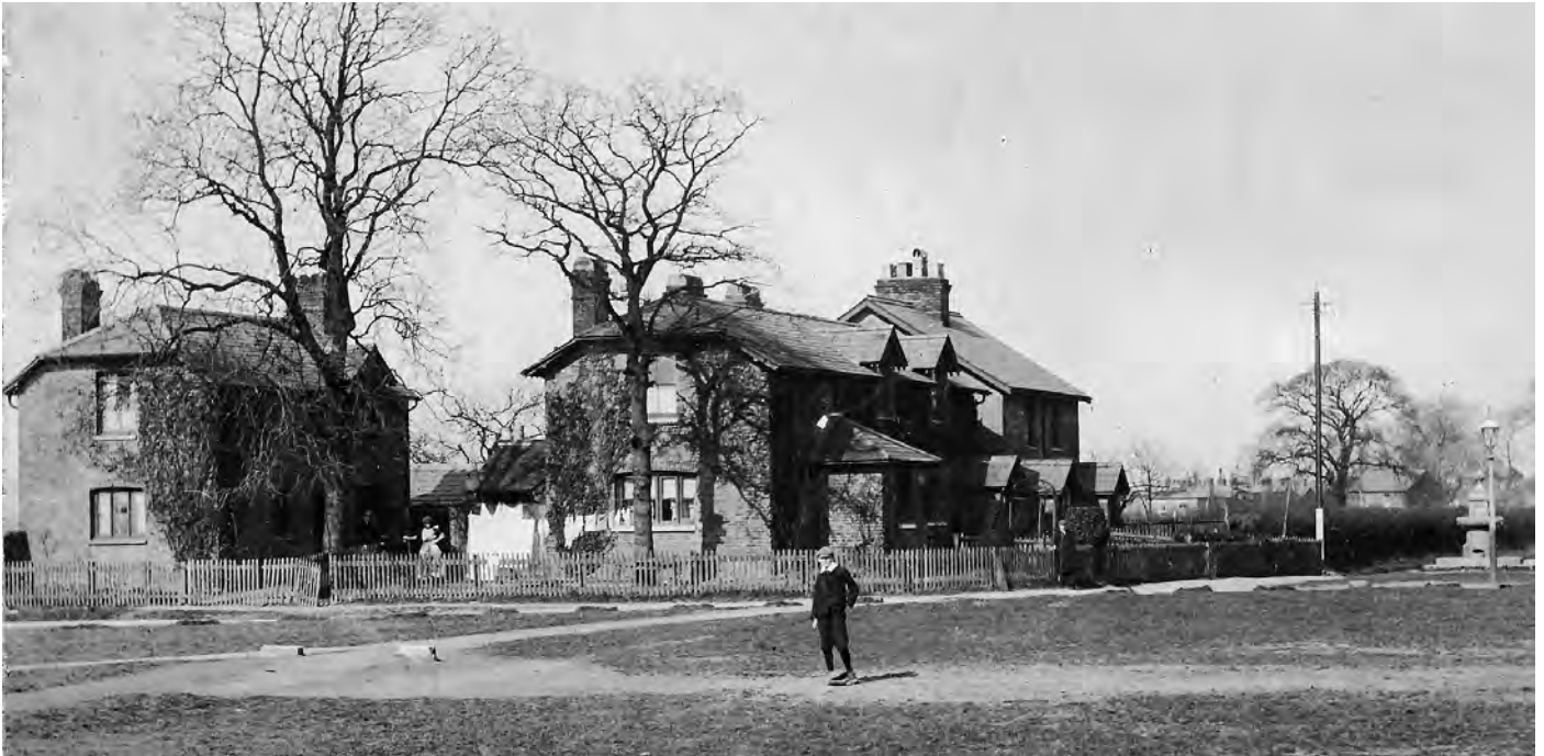
Former Watford Heath School

A cluster of five small brick-built cottages stands behind the bus stop on Watford Heath. These cottages were once an elementary school, built in the 1850s to serve the hamlet of Watford Heath, which is situated south of Watford on the main road to Harrow and Pinner. This elementary school is of particular interest because it was among the first - possibly the first - to introduce the teaching of cookery.