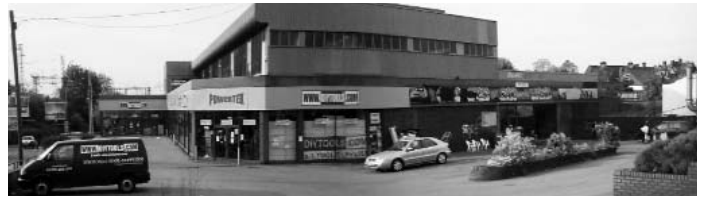
The JR Tagger site is being targetted by developers again.

Please be prepared to take a public stand against this mass over-development of Oxhey. OVEG will raise a petition as well as a standard letter that